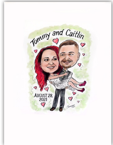
Actual client sign-in board sample