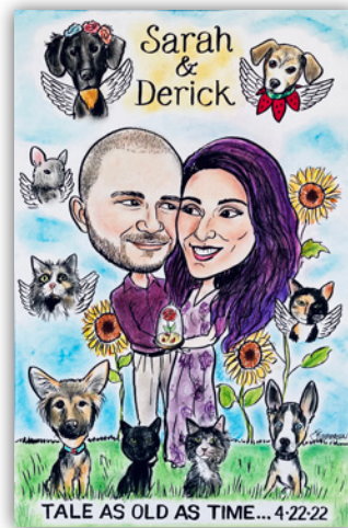
Actual client caricature commission, then matted for alternate sign-in board use