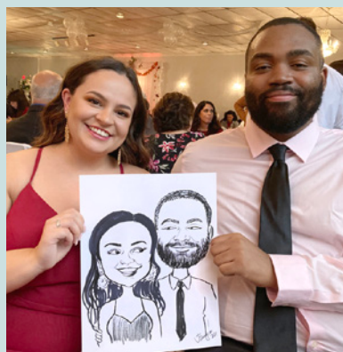
Above left: Drawing at a carousel house wedding. Above right: BW sample of couple drawn at 2021 wedding shows the likeness and most common style at weddings.