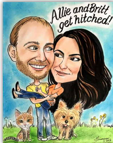
Actual client caricature commission sample