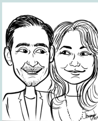
Above Left: Actual wedding guests display their drawing. Above Right: BW sample of couple drawn at dinner indicates the style and quality received at a typical event.