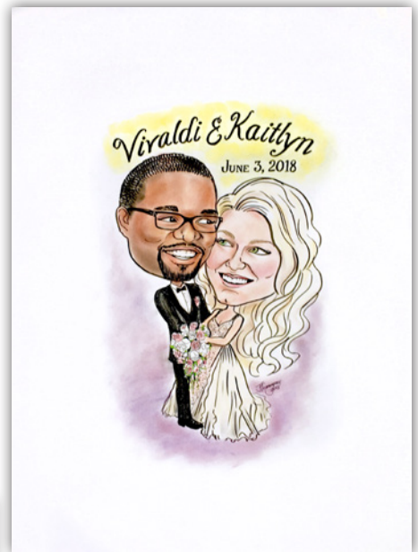
Actual client sign-in board sample